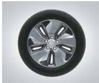
R17 (D=436.6 mm) EV exclusive alloy wheels