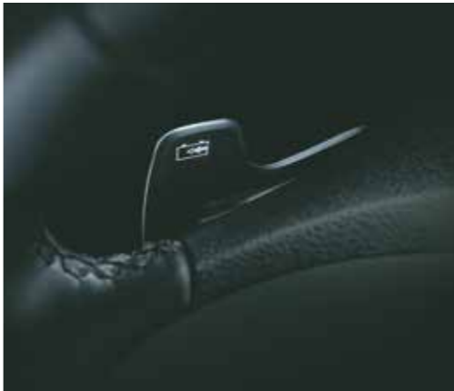
One pedal driving