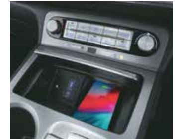
Wireless phone charger