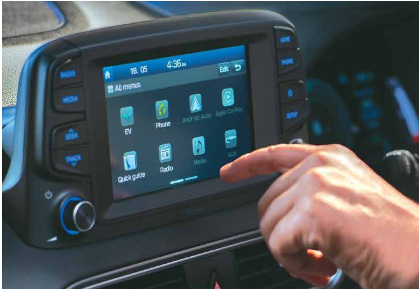
17.77cm (7") Touchscreen Display Audio with Android Auto and Apple CarPlay screen

Get ready for a hassle-free life with Hyundai Kona Electric that has been created to fit in your world seamlessly. Now you can access your phone, your favourite music and maps, using the multimedia touchscreen display that comes with Apple CarPlay and Android Auto compatibility. To ensure your phone never runs out of battery, there is a wireless charging pad.