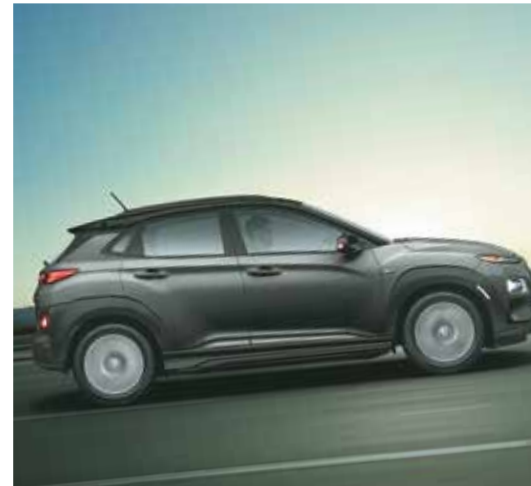
Hill-start assist control (HAC)