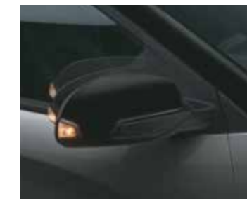
ORVM (heated) with electric adjust and folding