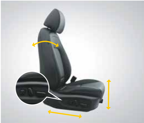
10-way power driver seat with lumbar support