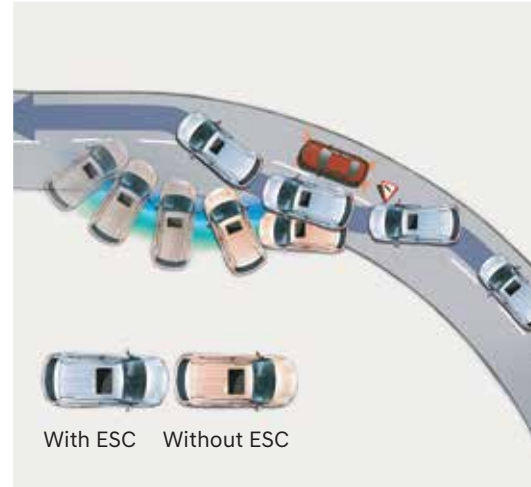
Electronic stability control (ESC)