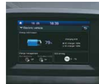
EV menu screens