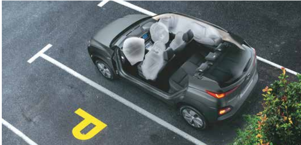
6 Airbags (driver, passenger, front side & curtain)

Hyundai Kona Electric comes with superior safety features to keep you out of harm's way. Made of ultra-high tensile strength steel, Hyundai Kona Electric offers high impact energy absorption that keeps the passengers safe in the unfortunate event of a collision. The cabin has been especially designed to disperse energy to reduce impact on the occupants.