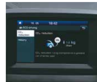
ECO driving information