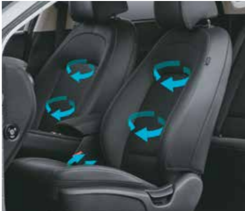
Front ventilated and heated seats