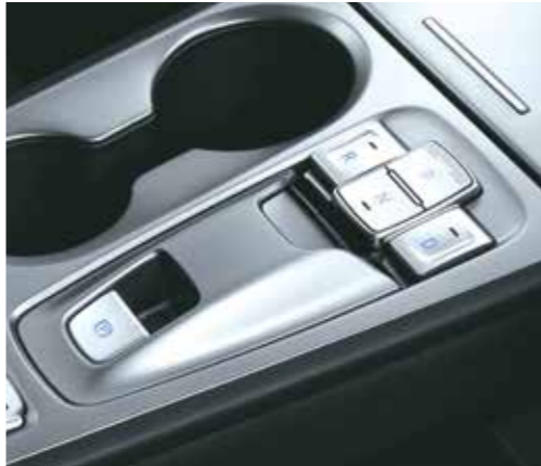
Shift-by-wire automatic transmission and electric parking brake

The second you get into Hyundai Kona Electric, you enter the heart of unmatched comfort. Intelligently placed button type shift-by-wire system, impeccably designed bridge-type centre console; everything has been designed and positioned to make your driving experience as smooth as possible.