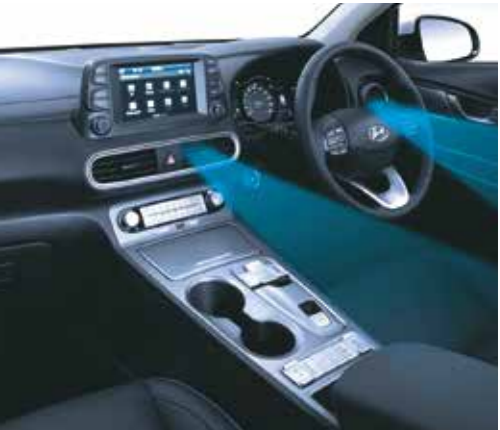
Option of driver only air conditioning

Other features: Bridge-type centre console | Leather wrapped steering wheel | LED luggage lamp Leather seats | Rear adjustable headrests | Rear split seats 60:40 | Soft touch dashboard