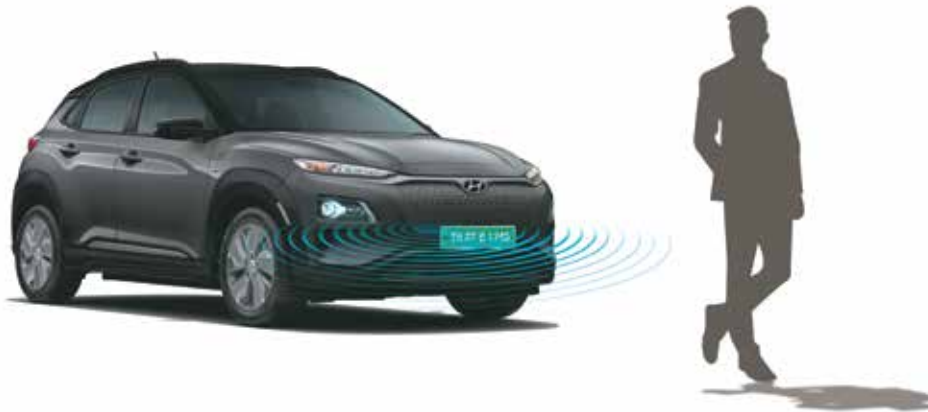
Virtual engine sound system When the vehicle is in motion, VESS generates an engine sound to ensure pedestrian safety