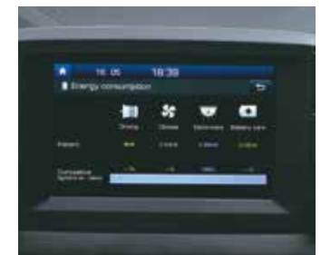
Power consumption information