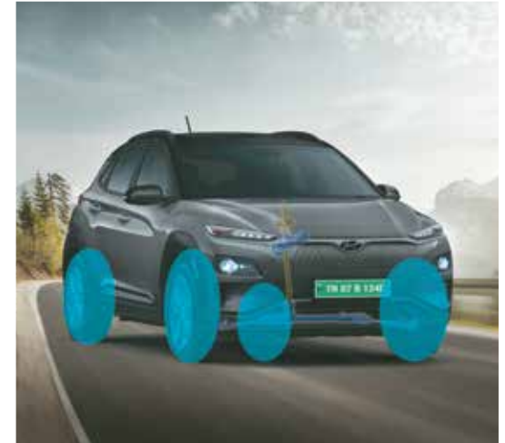
Vehicle stability management (VSM)