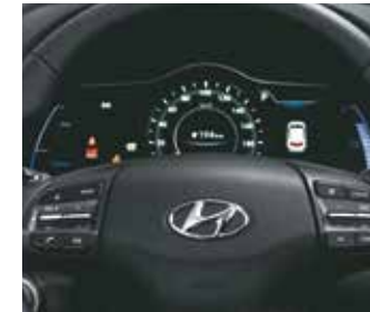
Digital instrument cluster with supervision