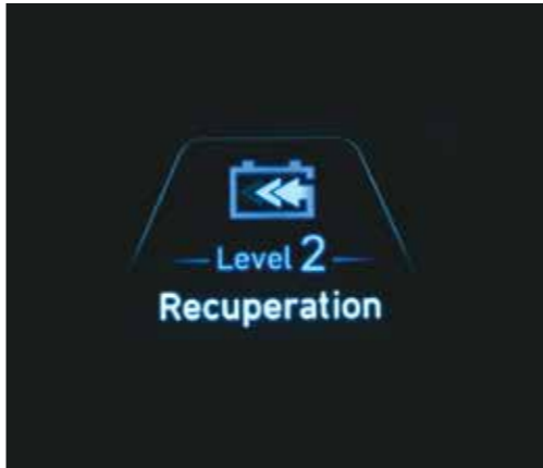
Paddle shifters (for regenerative braking)