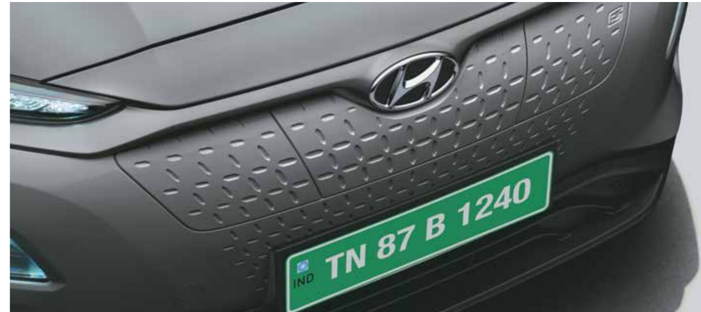
Modern, clean & integrated front grille design optimized for superior aerodynamics