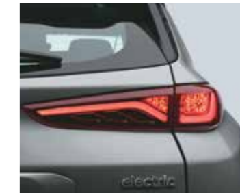
LED tail lamps