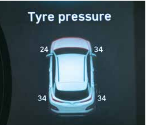
Tyre pressure monitoring system (high line)