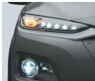
Distinctive split type LED headlamps with LED DRLs

Other features: Roof rails | Body color ORVM with turn indicators | Body colour door handles | Dual tone roof (option) | Smart electric sunroof with safety | Side sill molding – black